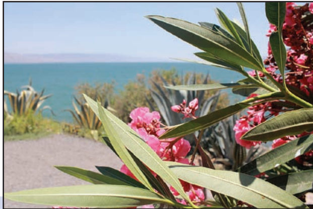
Here in Israel, I am once again amazed by the beauty of this Land God gave to His Jewish people. Above, I stood on a hillside overlooking the Sea of Galilee. To the right, we came across a flock of sheep having their lunch in a pasture in the Galil (the Galilee area).