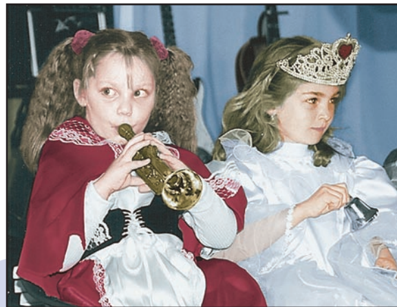
During the holiday of Purim, Jewish people around the world remember how God used Esther to miraculously preserve His chosen people. On this special day, Jewish children dress up in costumes, the book of Esther is read, and special cookies, called Hamantashen (right) are eaten.